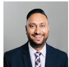
Inder Nirman 02 8883 3592